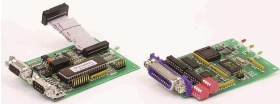
Card for inserting in power supply