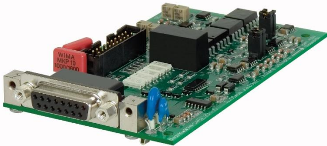
Card for inserting in power supply